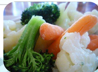
Steamed or Sautéed Veggies